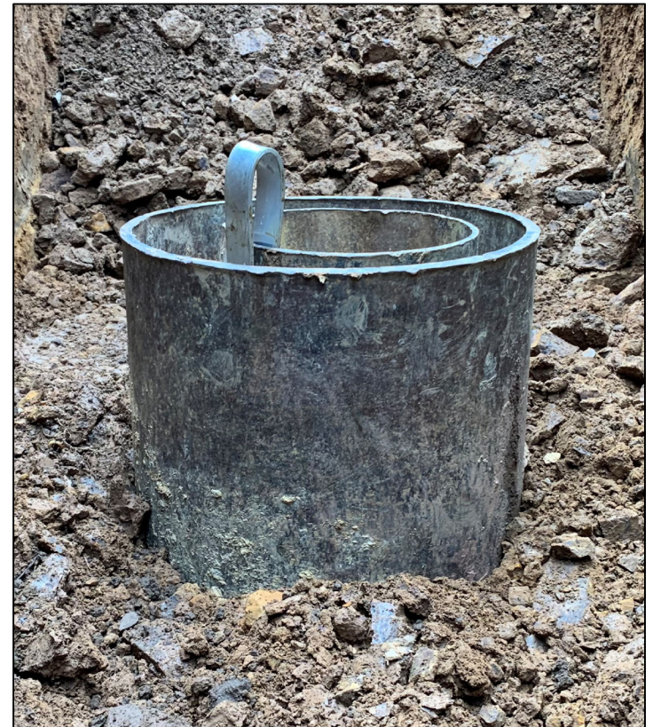
Gauge Installed on DRI